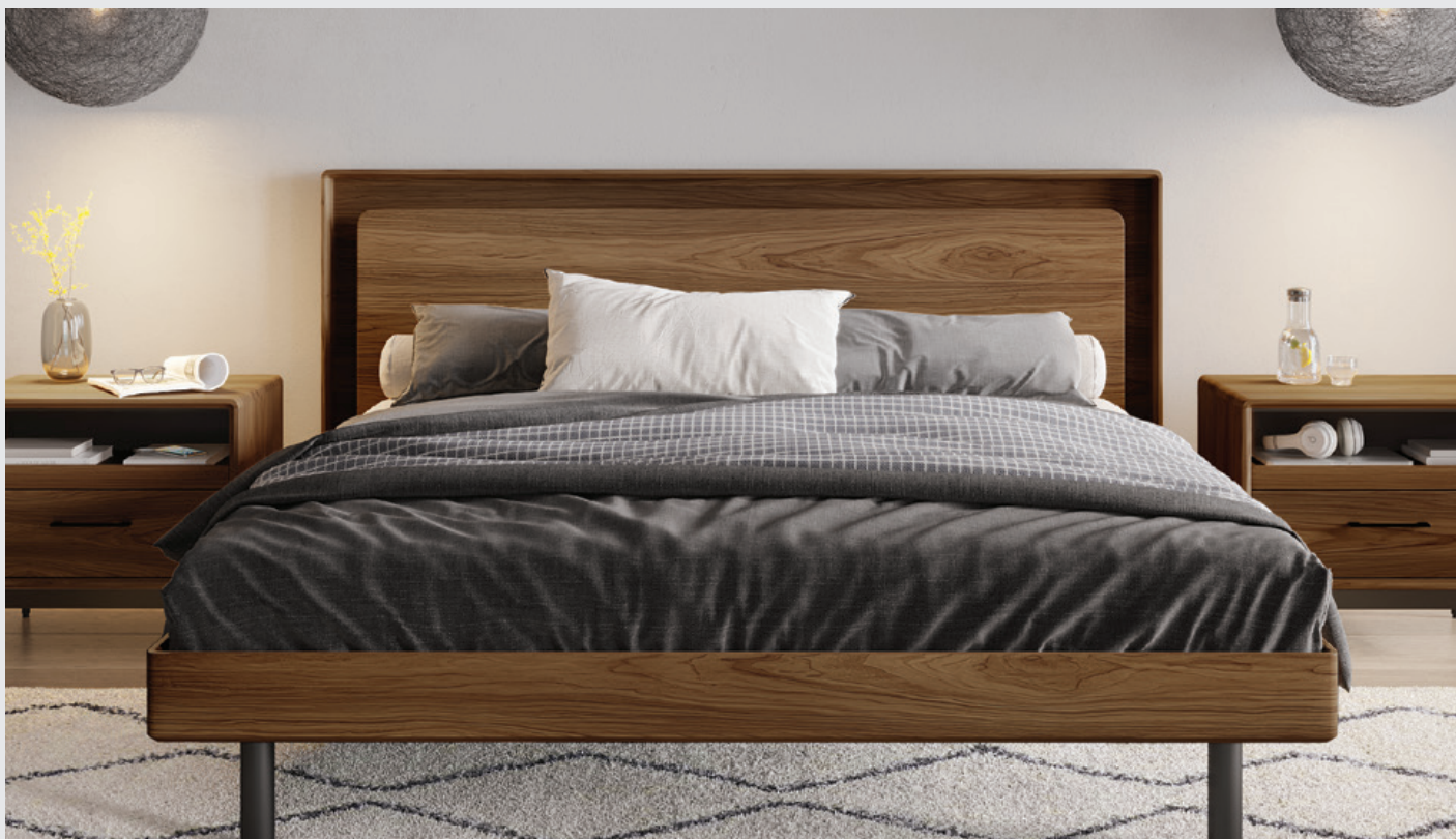
Up-LINQ 9119 King Bed with 28" Nightstands