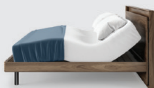
Platform Position: Low Frame Position: High Platform Height: 11 in | 28 cm (12" Adjustable Mattress shown)