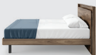
Platform Position: High Frame Position: High Platform Height: 14 in | 36 cm (10" Mattress shown)