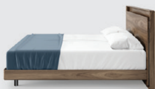
Platform Position: High Frame Position: Low Platform Height: 11 in | 28 cm (12" Mattress shown)